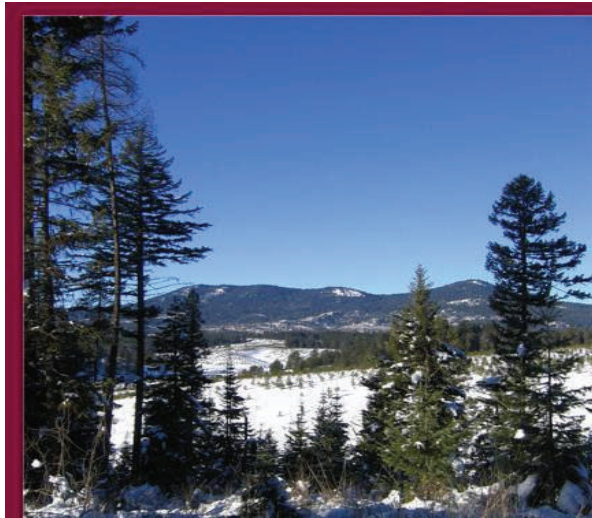
Beautiful Moscow Mountain in winter

Selected applicants will be notified by April 25 2007.