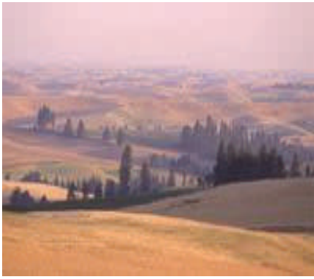
Land of the Palouse